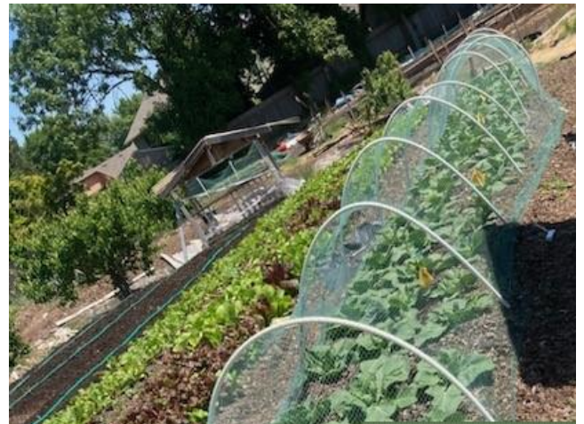
GrassRoots Garden efforts to fight the battle of the wire worms