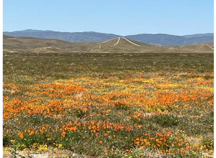
Above: Wildflower bloom in the Antelope Valley, CA Below: California Coastal Dahlias at Point Loma, CA.

with nature to care for and protect what God has so graciously provided.