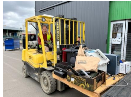
Sorting... Unloading... & hauling away